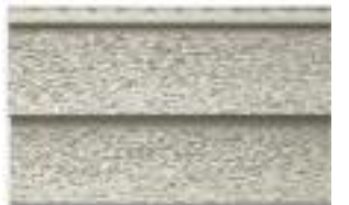
Double 5" clapboard