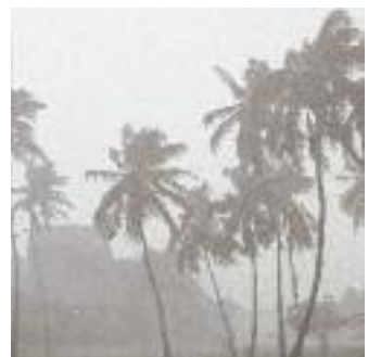
In independent tests, Window World 4000 Reinforced Vinyl Siding withstood category 5 hurricane-force winds.

Window World 4000 Reinforced Vinyl Siding is backed by a lifetime, limited transferable warranty*—including fade and hail protection. Protecting not only you, but the next owner of your home as well.