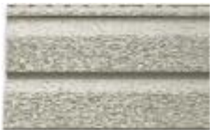
Double 5" dutch lap