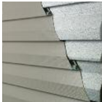
Window World 4000 Energy Plus Siding improves energy efficiency and has a beautiful finished appearance.