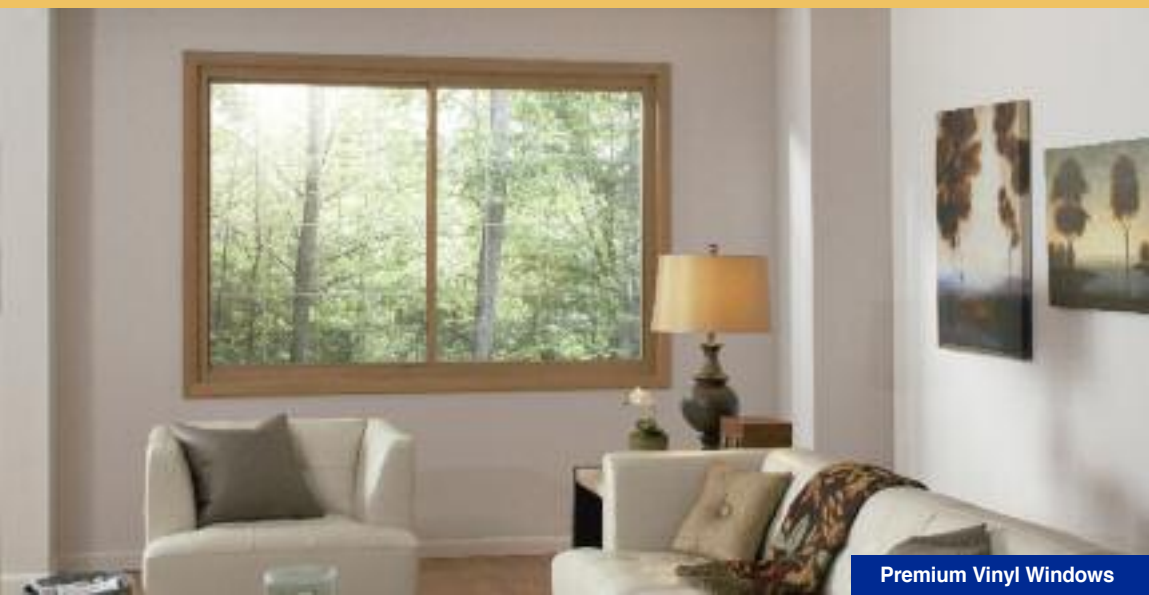
Premium Vinyl Windows