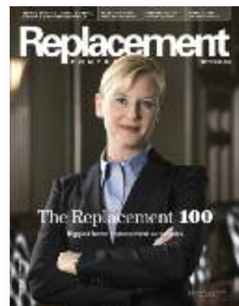
Window World Tops 2012 National Remodeling Rankings.