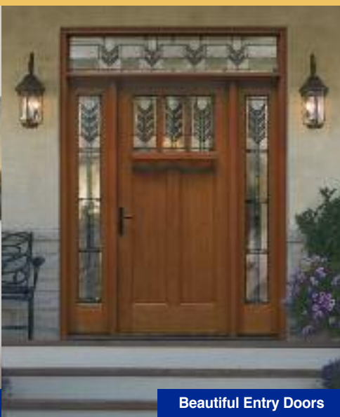
Beautiful Entry Doors

Window World Premium Replacement Windows are designed for superior performance and exceptional beauty. Choose from Double-Hung, Sliding, Casement, Awning, Bay, Bow, and Garden Windows and beautiful Patio Doors. All windows feature a multi-chambered sash and mainframe structure which helps to create insulating air space for superior thermal efficiency. Additionally, the optional SolarZone™ Insulated Glass package offers optimal performance in any climate.