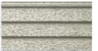
Triple 3" clapboard