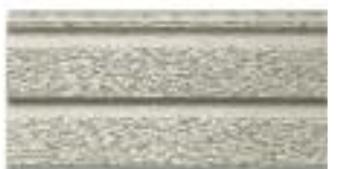
Double 4" dutch lap