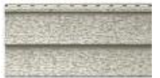
Double 4" clapboard