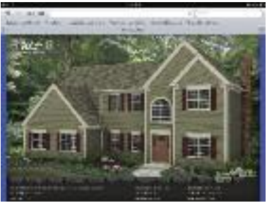
Our Window World Design Showcase will help you choose the most attractive products for your home. Available online or as a tablet app.

Window World Premium Siding Systems are the smart choice when considering green building practices because they meet the high standards and criteria set by LEED.